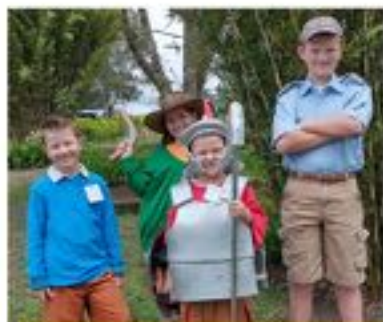
The primary school recently had a book parade. The kids dressed up as characters from books: Tintin (from the Tintin books), Nicky (from the Thea Sisters books), a Roman Centurion (from the Bible), Bob Griffin (from Cleared for Takeoff )