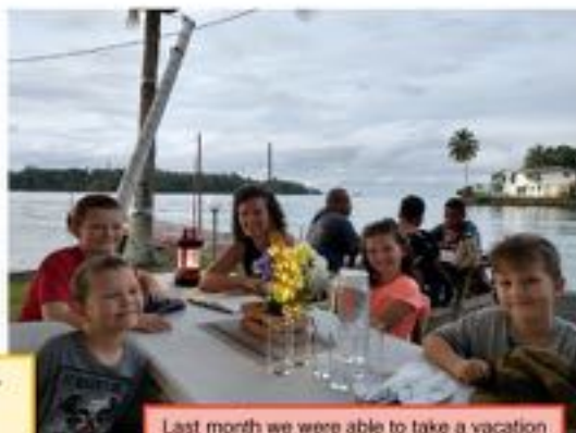
Last month we were able to take a vacation to the coastal town of Madang where we enjoyed swimming and eating out!