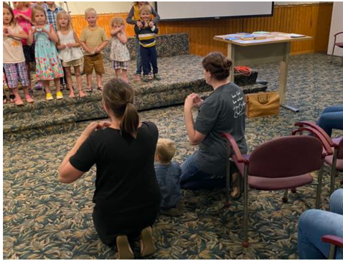
Family Retreat photos Labor Day weekend 2020