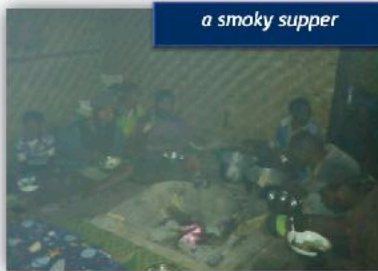
a smoky supper

Mid-afternoon, Jamie had flown in some school supplies for the local elementary school and then was to fly bags of green coffee beans out from the airstrip. But while he loaded the coffee and passenger, the rain and clouds moved in and made a takeoff unsafe in the mountain valley at 6,000 feet. So when the rain had let up but clouds remained, Jamie shared the gospel with a large group of kids and adults and continued to wait for the clouds to lift. A couple of times, the weather improved and it looked like Jamie might be able to takeoff and make the 12-minute flight home, but then the weather deteriorated again, and Jamie was staying for the night.