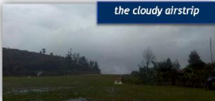
the cloudy airstrip