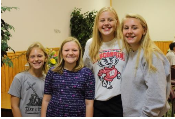
2018 HFM Family Retreat