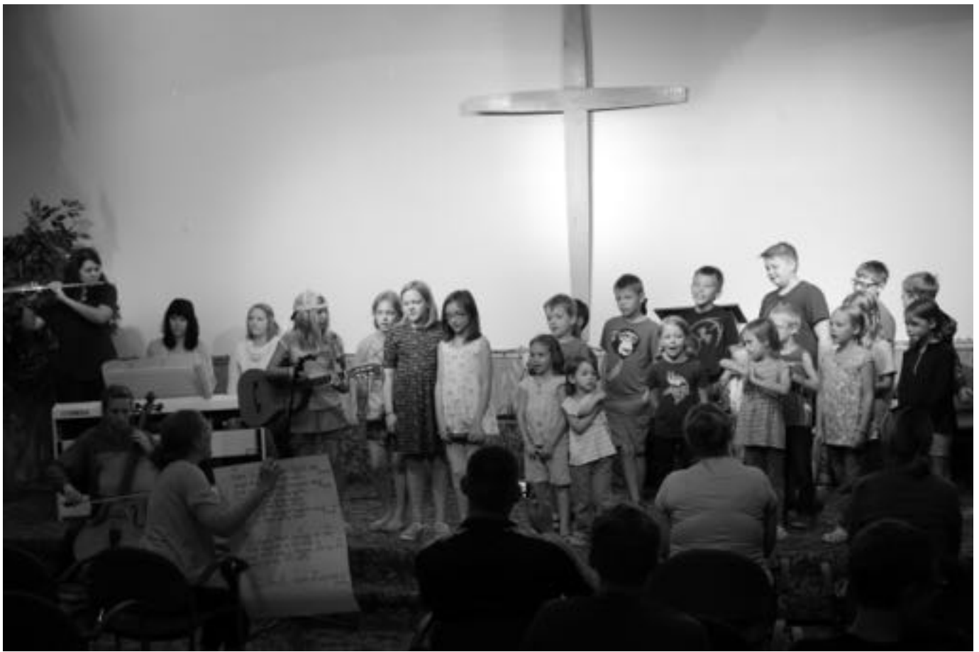
2018 HFM Family Retreat