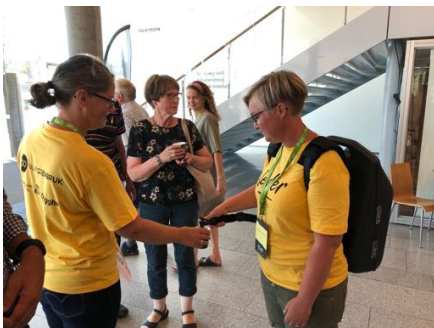
L: Worship at the General Assembly