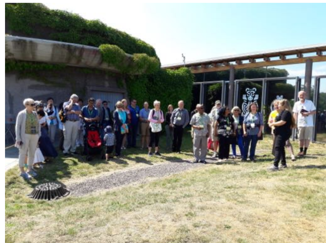
The international guests of NLM on an outing to a Viking Museum and later to a whaling museum as sightseeing gift from NLM.